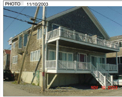
PHOTO 11/10/2003 BLDG COMMENTS FY12 STYLE CHANGE FROM CONV TO COL PER FIELD REVIEW.