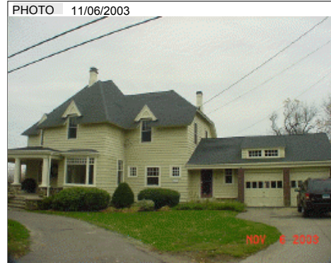
PHOTO 11/06/2003 BLDG COMMENTS sales review