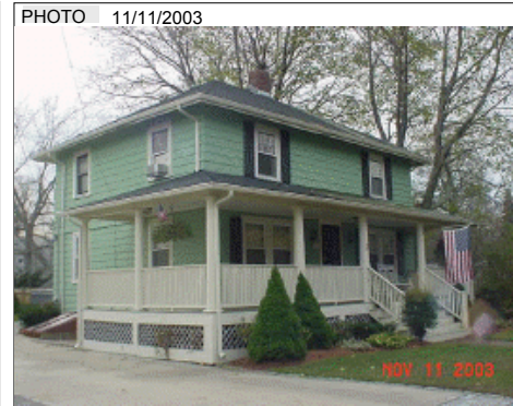
PHOTO 11/11/2003 BLDG COMMENTS FY12 QUALITY CHANGE FROM GD TO AVG PER FIELD REVIEW.