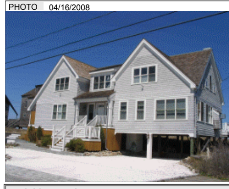
PHOTO 04/16/2008 BLDG COMMENTS OTHER FIX=SHOWER FY12 STYLE CHANGE FROM CONV TO CAPE PER FIELD REVIEW.