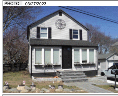
PHOTO 03/27/2023 BLDG COMMENTS