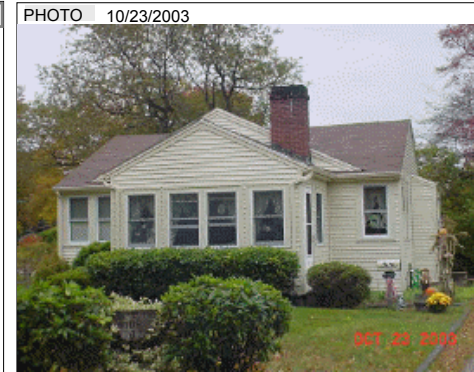
PHOTO 10/23/2003 BLDG COMMENTS FY12 STYLE CHANGE FROM CONVENTIONAL TO COTT/BUNG PER FIELD REVIEW.