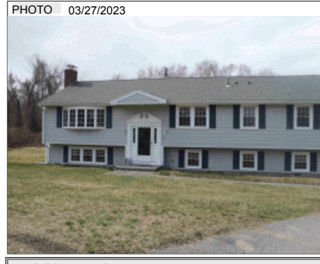
PHOTO 03/27/2023 BLDG COMMENTS MLS