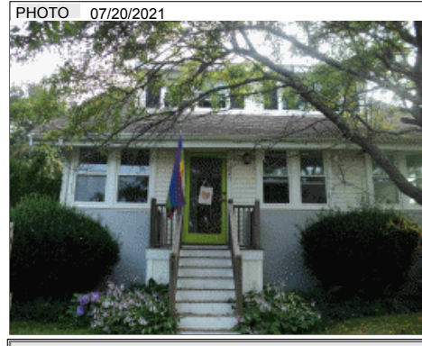
PHOTO 07/20/2021 BLDG COMMENTS FY12 FR- CAPE TO CONV