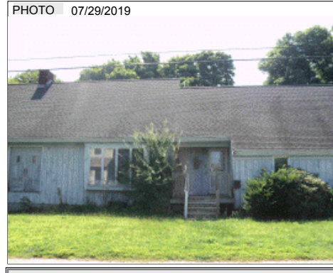
PHOTO 07/29/2019 BLDG COMMENTS PORTIONS OF DWELLING (INTERIOR) NEVER FINISHED