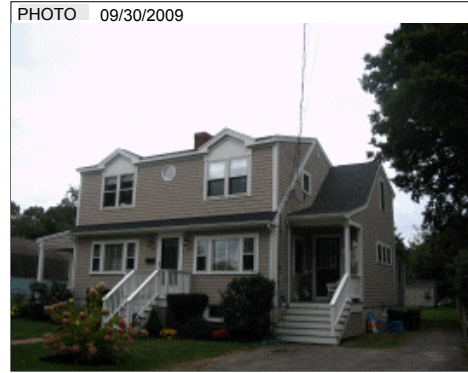
PHOTO 09/30/2009 BLDG COMMENTS FY12 FR- COLONIAL TO CAPE