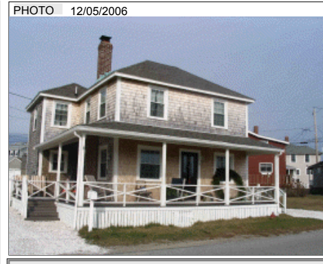
PHOTO 12/05/2006 BLDG COMMENTS