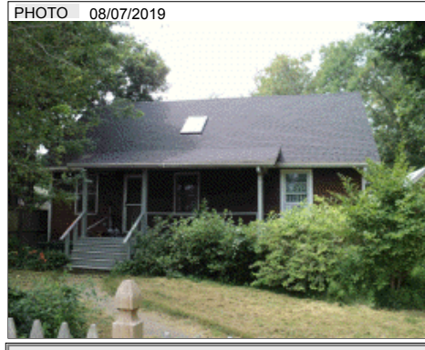
PHOTO 08/07/2019 BLDG COMMENTS Outside Shower