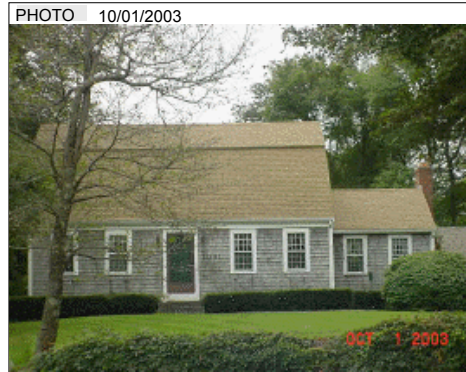
PHOTO 10/01/2003 BLDG COMMENTS FY12 FR-G TO AVE