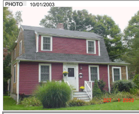
PHOTO 10/01/2003 BLDG COMMENTS FY12 FR- COLONIAL TO CONV GOOD TO AVG