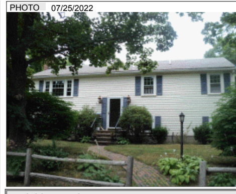
PHOTO 07/25/2022 BLDG COMMENTS IN-LAW APT/ LEGAL ACCESSORY DWELLING MLS