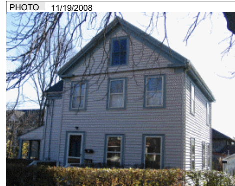
PHOTO 11/19/2008 BLDG COMMENTS FY12 QUALITY CHANGE FROM GD TO AVG+ PER FIELD REVIEW. STYLE CHANGE FROM COL TO CONV.