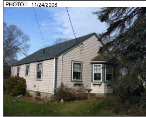
PHOTO 11/24/2008 BLDG COMMENTS FY12 FR-RANCH TO COTT