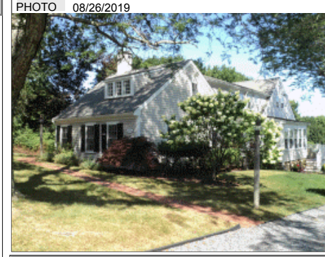
PHOTO 08/26/2019 BLDG COMMENTS MLS V to G FY22