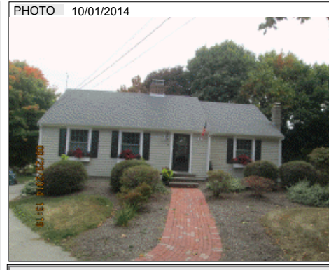
PHOTO 10/01/2014 BLDG COMMENTS pull down stairway to atu