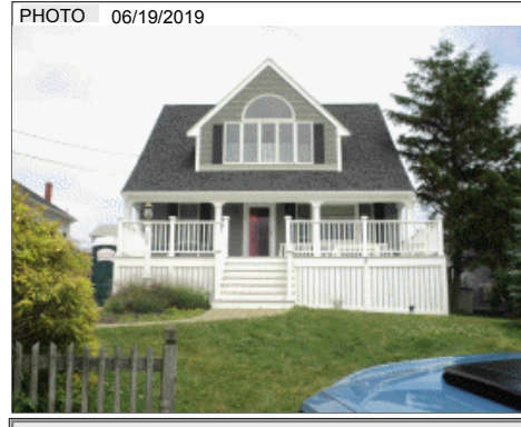
PHOTO 06/19/2019 BLDG COMMENTS Outside Shower