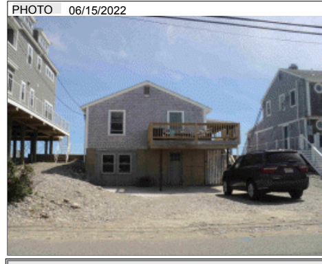
PHOTO 06/15/2022 BLDG COMMENTS FY12 FR- COTT/BUNG TO RANCH