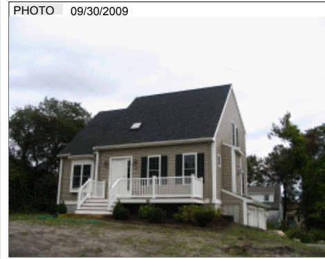
PHOTO 09/30/2009 BLDG COMMENTS FY12 QUALITY CHANGE FROM GD TO AVG PER FIELD REVIEW.