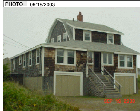
PHOTO 09/19/2003 BLDG COMMENTS FY12 FR- COLONIAL TO CONV