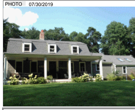
PHOTO 07/30/2019 BLDG COMMENTS