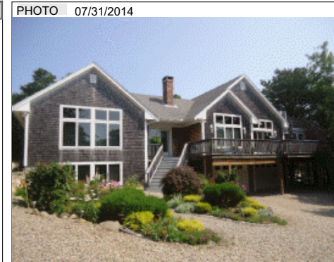
PHOTO 07/31/2014 BLDG COMMENTS LLF=BR+FR+LAUNDRY RM+FULL BATH (INCL IN RM/BR/BA COUNT).