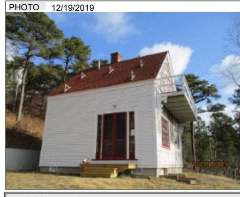
PHOTO 12/19/2019 BLDG COMMENTS CHECK HEAT+FLR COVER+FDN IN NEXT LIST (ESTIMATED)