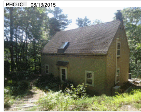
PHOTO 08/13/2015 BLDG COMMENTS HEAT=GAS RINNAI HEATER & WOODSTOVE ON 1ST FLR; HAS MINI-SPLIT UNIT FOR A/C ONLY ON 2ND FLR; ONLY 1 BR (2ND FLR SLEEPING AREA=OPEN LOFT) PER 8/13/15 LIST.