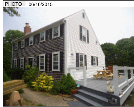
PHOTO 06/16/2015 BLDG COMMENTS JUNE 2015 LIST REFUSAL BY OWNER VIA PHONE CALL.