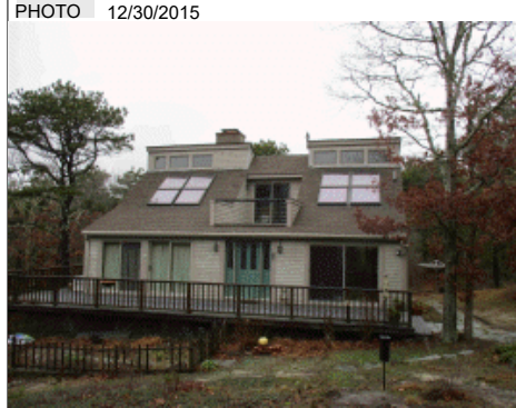
PHOTO 12/30/2015 BLDG COMMENTS Garage has attached artist studio w/loft at rear.