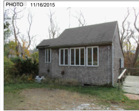
PHOTO 11/16/2015 BLDG COMMENTS PER 11/19/15 LIST, HAS KITCH W/ STOVE; HEAT=ELEC BB (BR ONLY),ELEC & GAS WALL HEATERS.