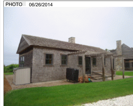
PHOTO 06/26/2014 BLDG COMMENTS ORIG SFR (SEC A) RENOVATED INTO GUEST HOUSE+ ADDED SEC B 2006. KITCH WILL HAVE NO STOVE PER BUILDER 6/5/07 (=SINK ONLY, NO STOVE PER 4/13/09 INSPCT BY JH).