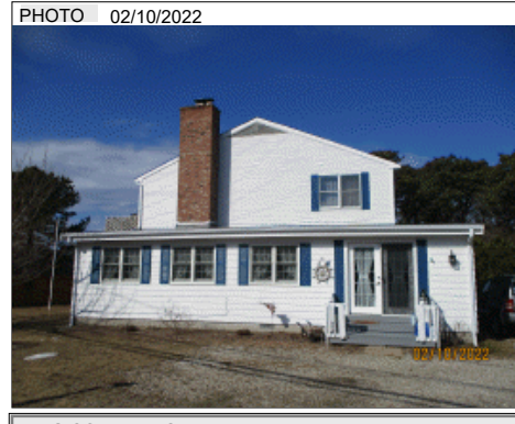
PHOTO 02/10/2022 BLDG COMMENTS Upstairs is separate dwelling space.