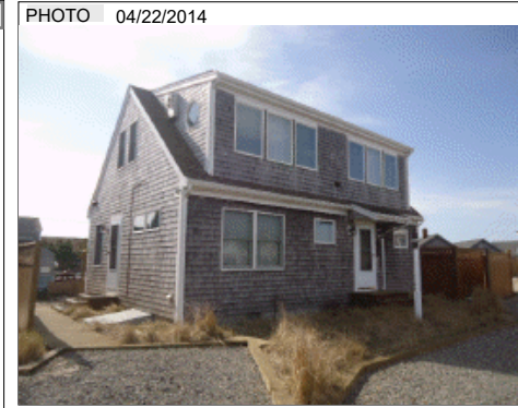
PHOTO 04/22/2014 BLDG COMMENTS BLDG D - UNIT 4 ON PLAN=2ND UNIT IN FROM ROAD. FPL=GAS. DEEDED SF=1163. UNABLE TO MEASURE WDK'S 4/22/14 (LOCKED GATE).