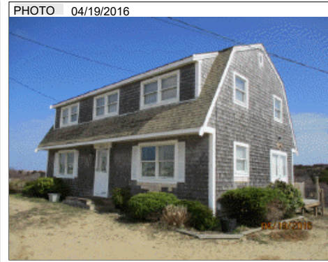
PHOTO 04/19/2016 BLDG COMMENTS NAUTILUS. UNIT 1 IN BLDG A ON SITE PLAN. HAS FUTURE OPTION TO INCR FOOTPRINT AND INCLUDE A SECOND UNIT). EXTRA FIXT=SINK IN WET BAR+IN UTIL RM.