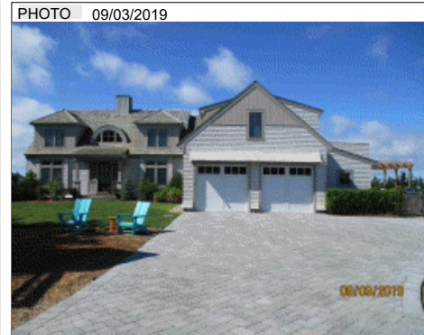
PHOTO 09/03/2019 BLDG COMMENTS BATHS=5 FULL+2 HALF. ALL BR'S ARE EN SUITE PER PLANS (INCL 1 HALF BATH IN AGR="CHANGING RM"). HEAT+A/C=HYDRO-AIR. ARBOR PATIO & OUTDOOR KITCHEN (GRILL, NO