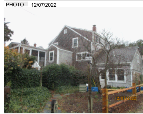
PHOTO 12/07/2022 BLDG COMMENTS Freestanding LP gas stove in LR. Bldg A per Plan 667/84 (9 Francis Rd) Minisplit.